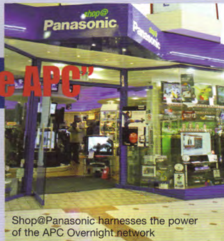
Shop@Panasonic harnesses the power of the APC Overnight network

"After trying every major courier service and having been let down time after time